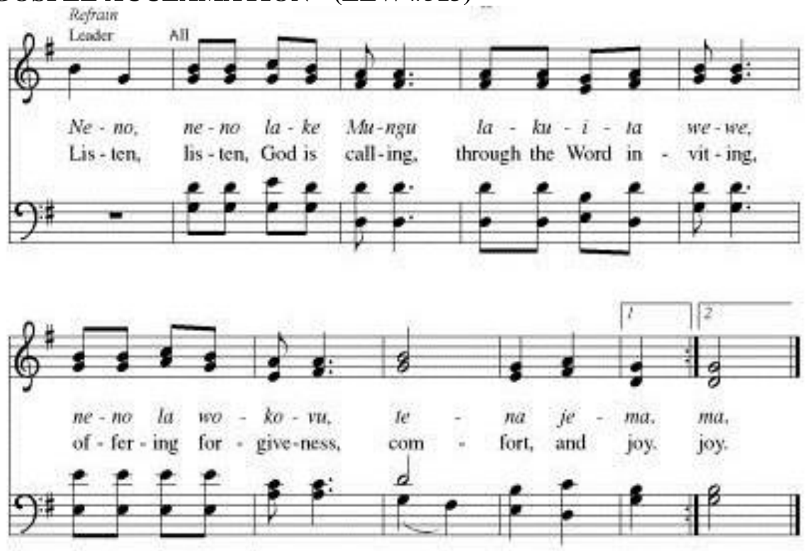
★ GOSPEL ACCLAMATION – (ELW #513)